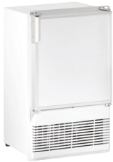
WHITE SOLID (FLANGE TO CABINET)